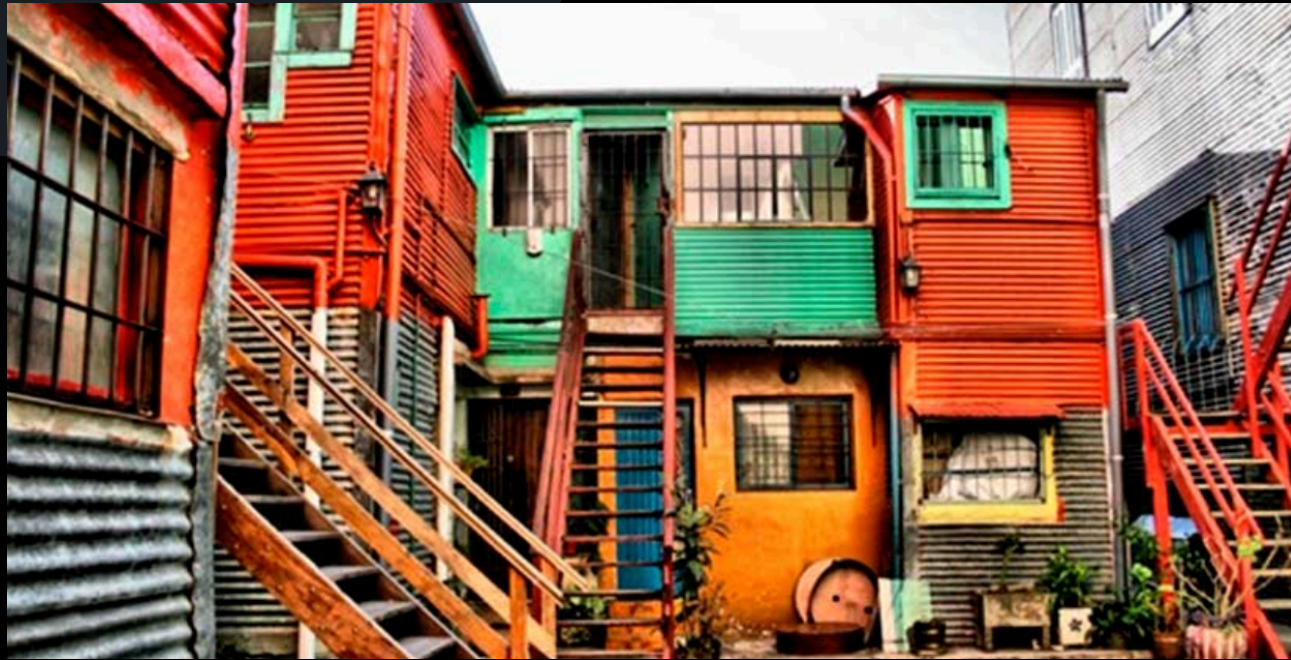
MFAH The Museum of Fine Arts Houston