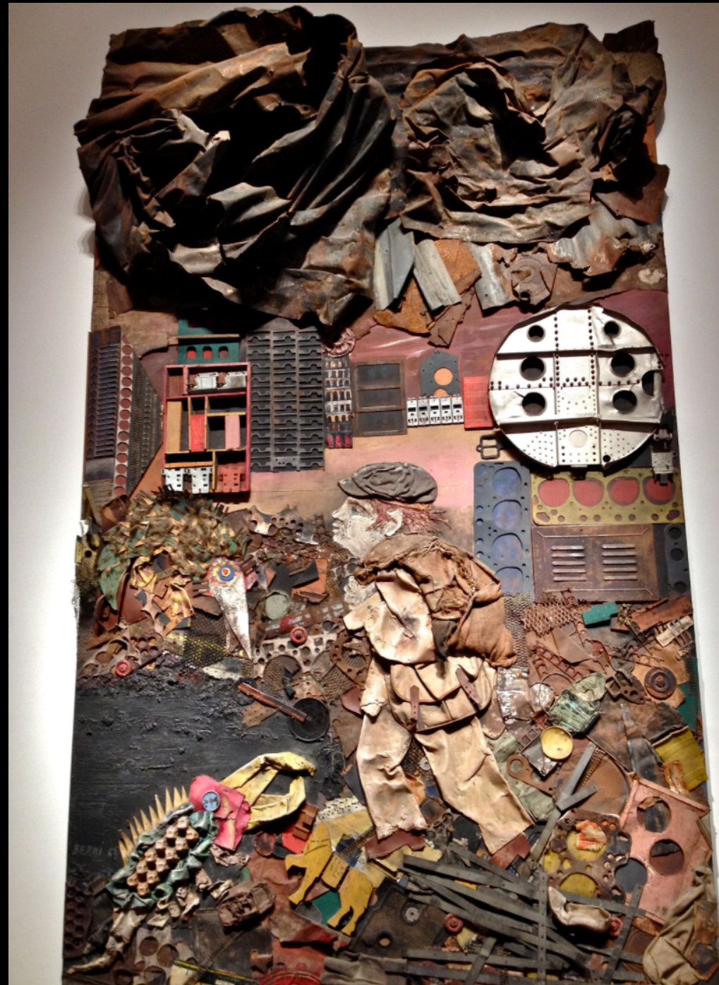
“Juanito va a la ciudad” Juanito Laguna Antonio Berni (1905-1981) Buenos Aires (1963)